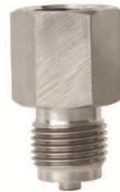
Pressure Gauge In-Line Filters, Model 910.22