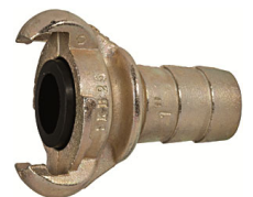
KT 25 SB