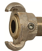
KA 34 M