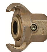
KI 34 M