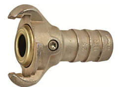
KT 25 M