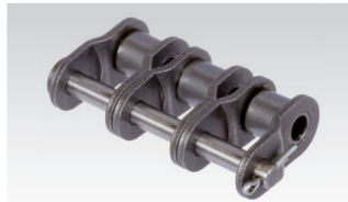
No. 12/L: Cranked Link with Cottered Pin