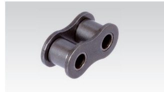
No. 4/B: Inner Link (3 Pieces Required)

Ordering Details: e.g.: Product No. 131 003 00, Connecting Link No. 11/E, 06 B-3