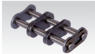
No. 11/E: Connecting Link with Spring Clip