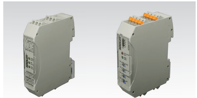
Product No. 430 460 41

Ordering Details: e.g.: Product No. 430 460 41, Motor controller MAE